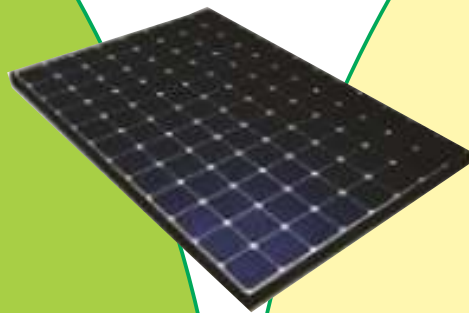
SOLAR PHOTO-VOLTAIC MODULE