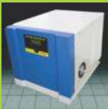
CHARGE CONTROLLER CUM INVERTER